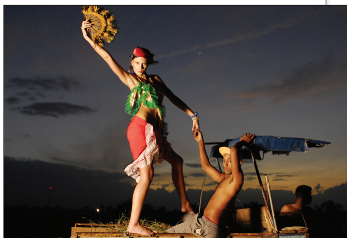
Cubans are infinitely friendly and never refused an offer to take photos in the middle of the highway.