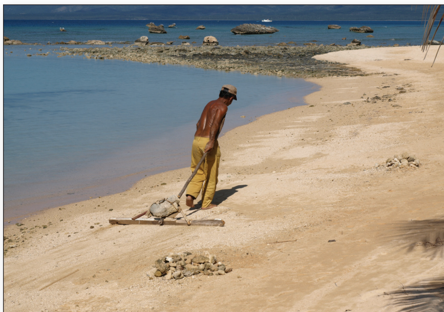
Maintenance men of beaches on the southern headland under Trinidad very responsibly cared for the convenience of visitors after each tide.