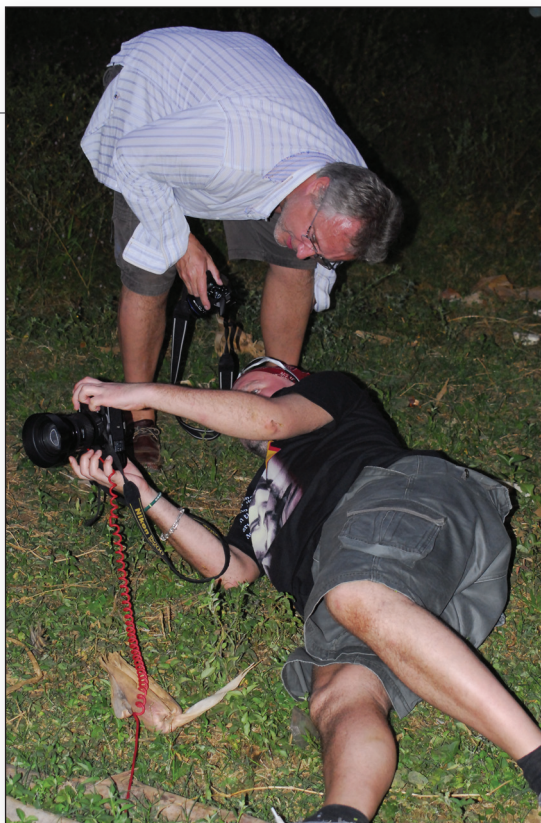
Bizarre positions of the brilliant Czech photographer Jakub Ludvík allowed to create other magnificent shots before our night departure.