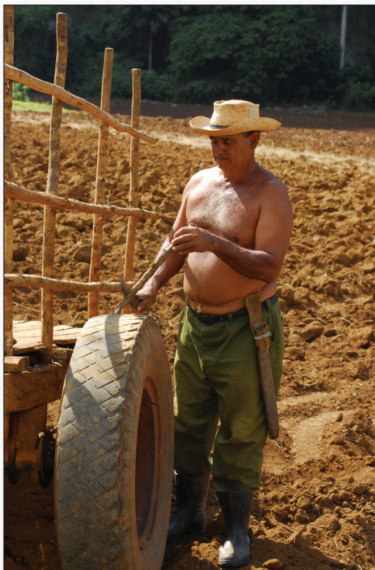
The farmer of tobacco plantation become our host, who was about planting a crop of Cuban cigars of the most exciting brands (Romeo y Julieta ...) for next year.