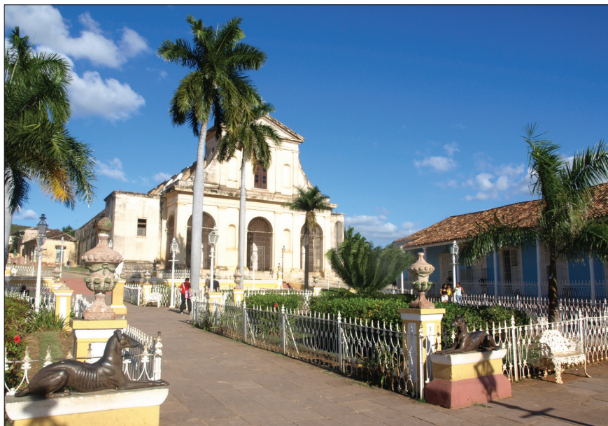
The important stop was in the oldest Cuban city of Trinidad, founded just 22 years after the landing of Christopher Columbus, registered since 1988 in the list of UNESCO World Cultural Heritage.