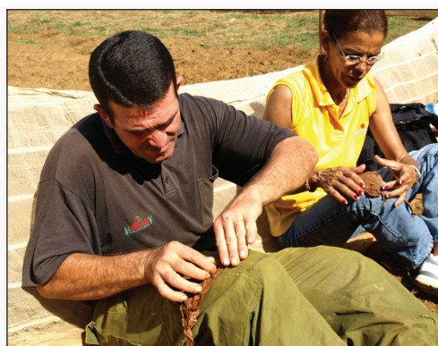
Left photo: After the work, the farmer showed us, under oath of keeping silence, his cave with endless sources of underground water, which is necessary for growing quality tobacco. Right photo: His son taught us to roll a real genuine Cuban cigar, so that we could lovingly smoke our masterpieces.