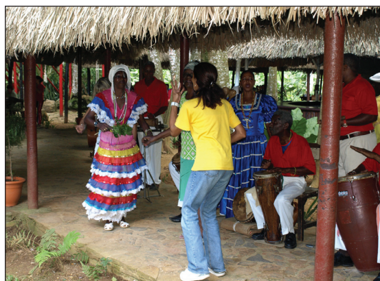
Local beauties were excited about the offer of making photos as models.